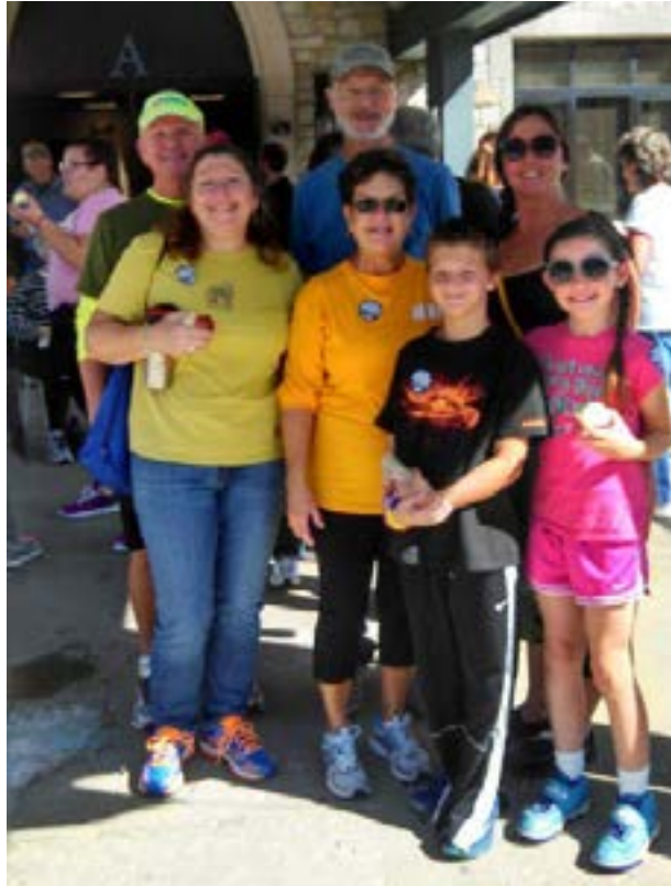
Members of the PCC Crop Walk team.

The Interchurch Food Pantry of Johnson County has been at its new location for more than five months. The new location allows the pantry to serve more people than ever before. The pantry helps an average of 1,500 households each month in the new location (compared to 1,000 households per month in 2014 and 735 households per month in 2013).